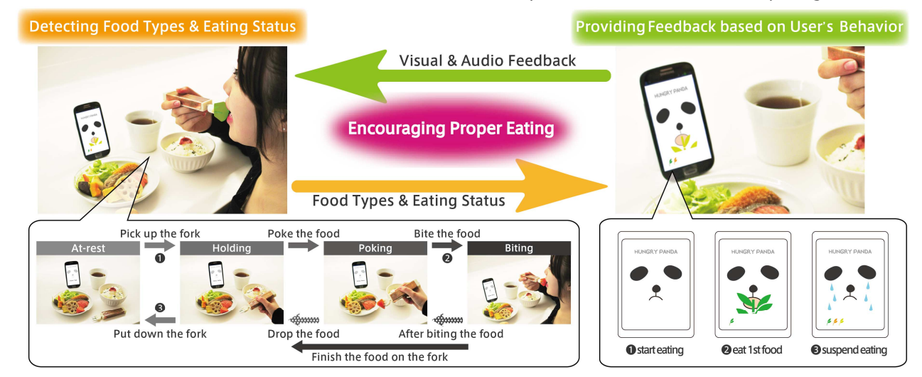
Figure 1: Overview of Sensing Fork and Hungry Panda 2 application

As shown in Figure 2, the Sensing Fork embeds various miniature sensors including accelerometers, electrodes, and a color sensor. The color sensor detects the food color when the user pokes it. Three electrodes are located on the grip and on a pair of tines on the fork. These electrodes are used to detect the eating behavior of the user, such as biting and poking. The biting is detected using the grip and tine electrodes, which measure the conductivity through the user's hand, body, mouth, and food, whereas poking is detected