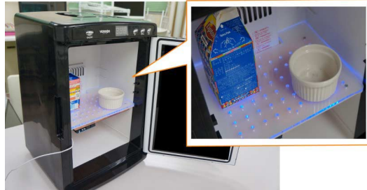
Fig. 2. Usages of the RefrigeMeter prototype

When the system adds reverse bias voltage to a LED, it can treat the LED as a light sensor by measuring the duration until the cathode voltage drops (voltage drop duration) [4]. The system can detect the existence of items on the LEDs based on this duration that changes along with the brightness of incident light: when the incident light becomes less, the duration becomes longer.