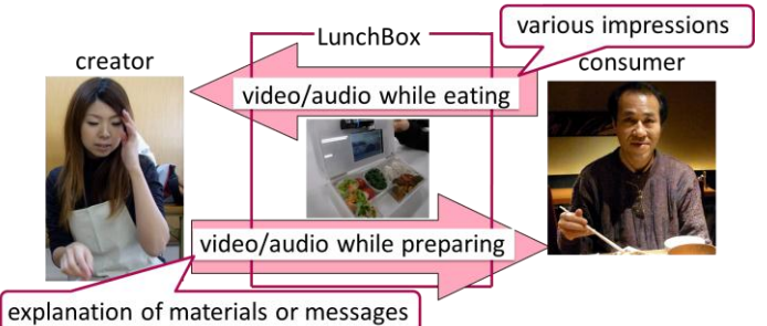
Fig. 1 Basic concepts behind the LunchCommunicator.

First, the LunchCommunicator can automatically record the processes of preparing/consuming the lunchbox using video and audio equipment. When a lunch-creator (e.g., a housewife) prepares a lunchbox, the system automatically captures video/audio of her activities, including explanations of the materials and messages to the lunch-consumer (e.g., her husband). Later, while eating the lunchbox, he can easily appreciate her efforts through the video automatically shown by the system. At the same time, the system also automatically captures video/audio of his activities, including impressions regarding the lunchbox and messages to the lunch-creator. Thus, the system does not require any special operations by users.