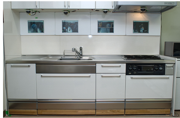
Figure 1: Kitchen of The Future. Each work area has an LCD, a camera (the hemispheres under the cupboards), a microphone, and a foot switch (the wooden panels).

We are using our kitchen to investigate the new form of interaction and communication facilitated by this environment. We are developing following