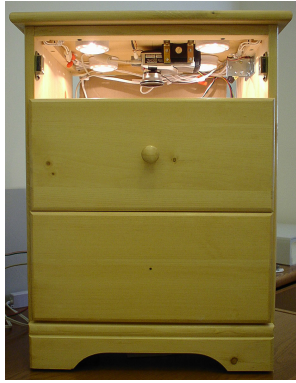
Figure 2: The Strata Drawer has a digital camera ( upper center ) and a laser diode ( upper right ) that is used to measure the height of the contents.