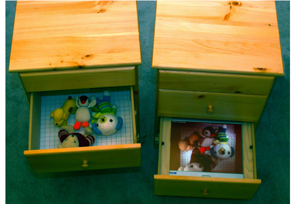
Figure 4: Overview of the Peek-A-Drawer. The photograph of the upper drawer in one cabinet is displayed in the lower drawer in the other cabinet.

A pair of Peek-A-Drawers was installed in a couple of families for 6 months: in a home of a granddaughter who was 11 years old, and of a grand-