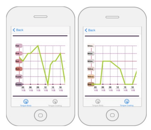
Figure 3: The tongue body (left) and coating (right) color graph reflecting health condition.

unstable. In her health condition diary, it referred that her digestive system was in trouble in that day because of overeating and over stress, and felt uncomfortable after that day. Therefore, we think our tongue color graph could give users and doctors some useful reference value in physical health inspection. As further feasibility test, we are asking 20s collage students to use the TongueDx application.